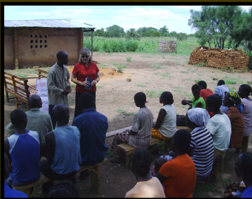
Preschool teacher training

Light of Africa is a USA approved 501c3 non-profit organization.